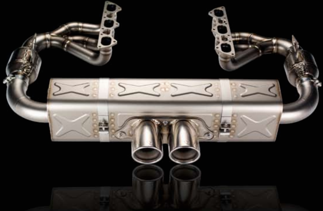
Porsche 911 GT3 Evolution Race system

Hard facts: Titanium, 16,5 HP plus, 22,7 Nm plus, 25,86 kg minus