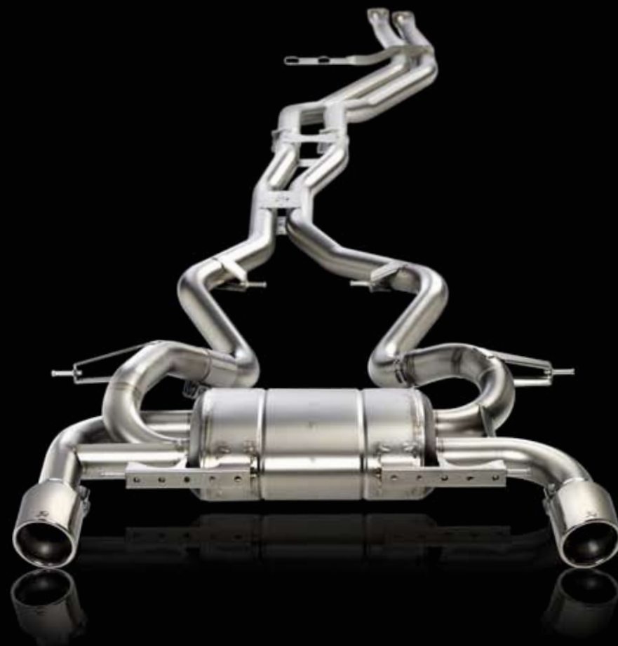
BMW 335i Evolution system

Titanium, 12,4 HP plus, 16,4 Nm plus, 19,85 kg minus